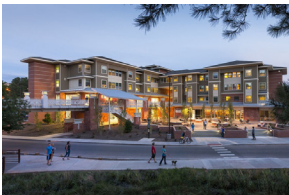
American Campus Communities

PJD has completed hundreds of multifamily projects ranging from small, luxury condominiums to large apartment communities as well as a variety of community clubhouses.