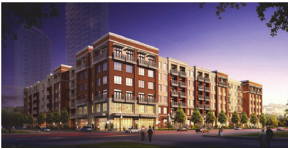
The Hanover Company