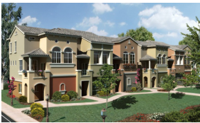
DR Horton Construction

DR Horton Construction: Tesoro Triplexes, Cave Creek Villas, Foothills Paseo Phase III, Tre' Bellavia Tivoli Townhomes, Via Citta Townhomes, Sunset Trails, Phase Cerrano II, Tre' Campana Tre' Collina, Villagio Happy Valley Townhomes, Villagio Happy Valley Triplexes, Via Sorento Townhomes, Pinnacle @ Desert Peak